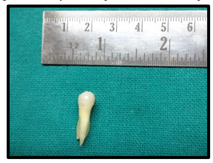
Fig. 4: Right maxillary second premolar (palatal aspect)