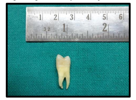
Fig. 3: Right axillary second premolar (distal aspect)