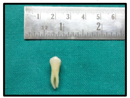
Fig. 5: Right axillary second premolar (buccal aspect)