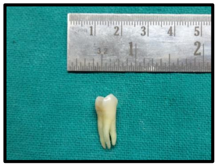
Fig. 6: Right maxillary second premolar showing all three distinct roots

which was fractured, and the same was delivered by using a fine apexo elevator. Post-operative healing was uneventful.